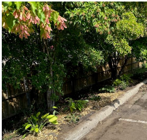
There were 83 hostas planted!