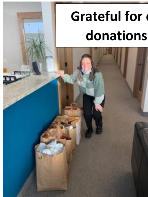
Grateful for our donations!