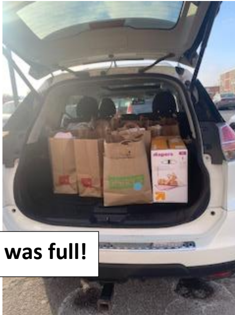
My trunk was full!