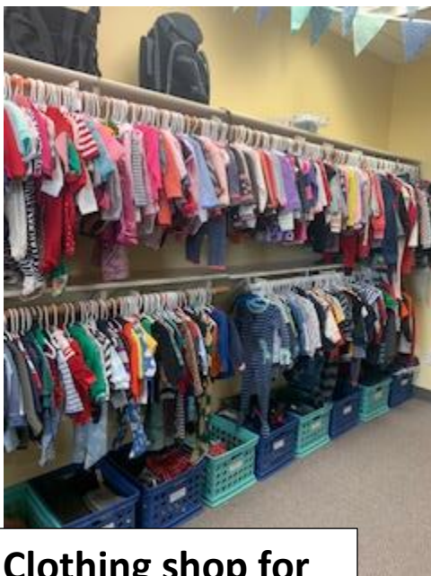
Clothing shop for soon-to-be parents!