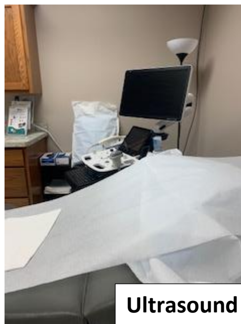
Ultrasound machine used to show LIFE!